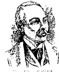
AN EVIDENCE MARY FACE